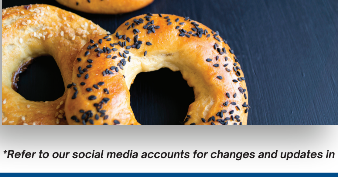
*Refer to our social media accounts for changes and updates in events.

Between April 15th to 19th, we are inviting you and your family to share how you "go green" on Facebook! By leaving a comment, you automatically qualify for our daily raffle draw. Each day, one lucky winner will be selected!