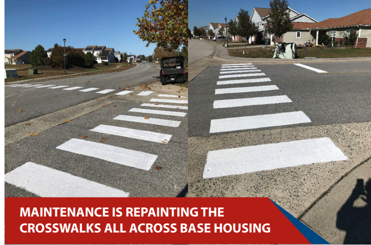
MAINTENANCE IS REPAINTING THE CROSSWALKS ALL ACROSS BASE HOUSING

Be on the lookout for an "elf off the shelf"! We will be hiding 6 elves around the property. Find and return one to the Leasing Office for a prize. Open to residents only and limited to one per household.